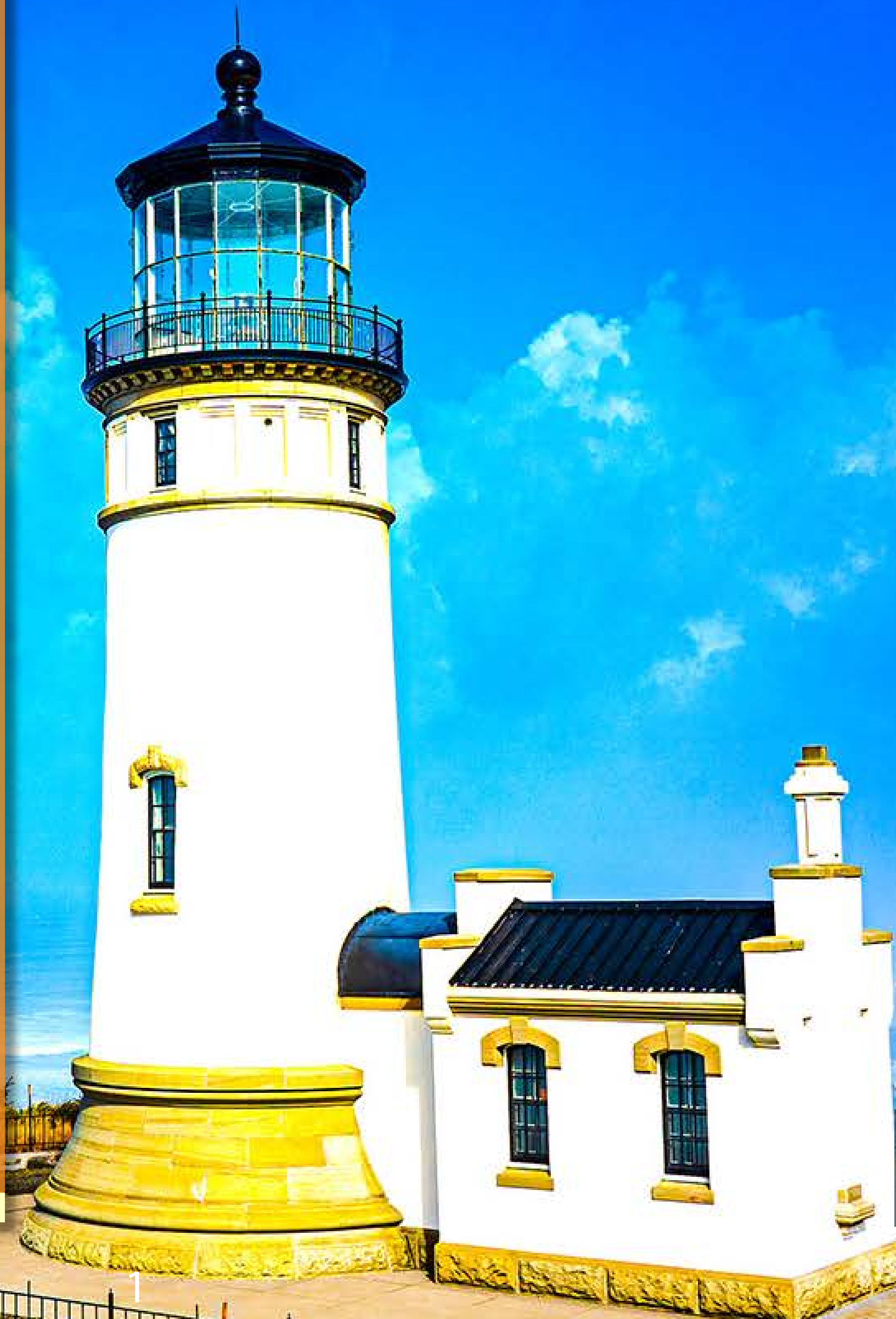
North Head Lighthouse on the Pacific coast, Washington