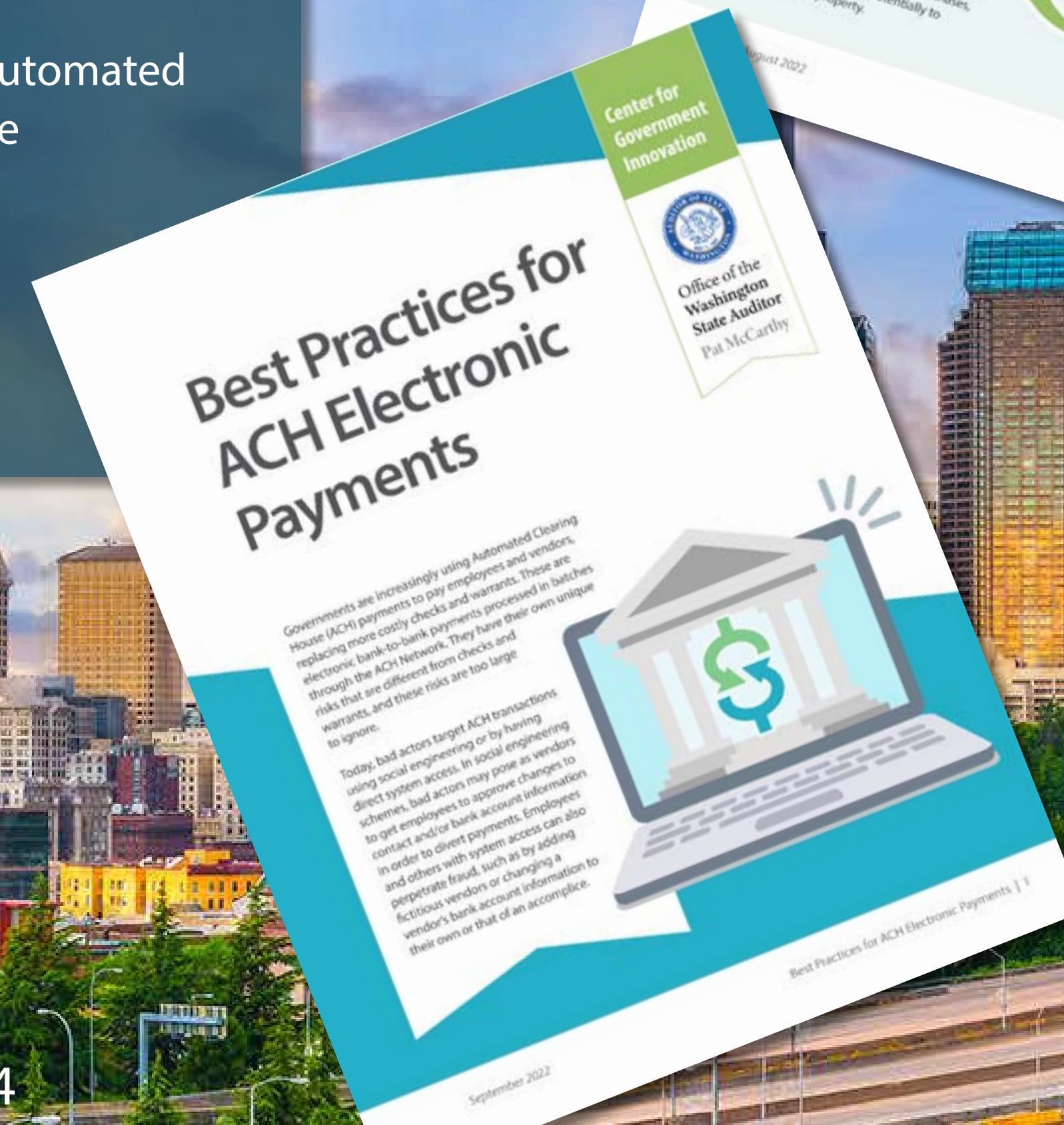
Seattle city skyline