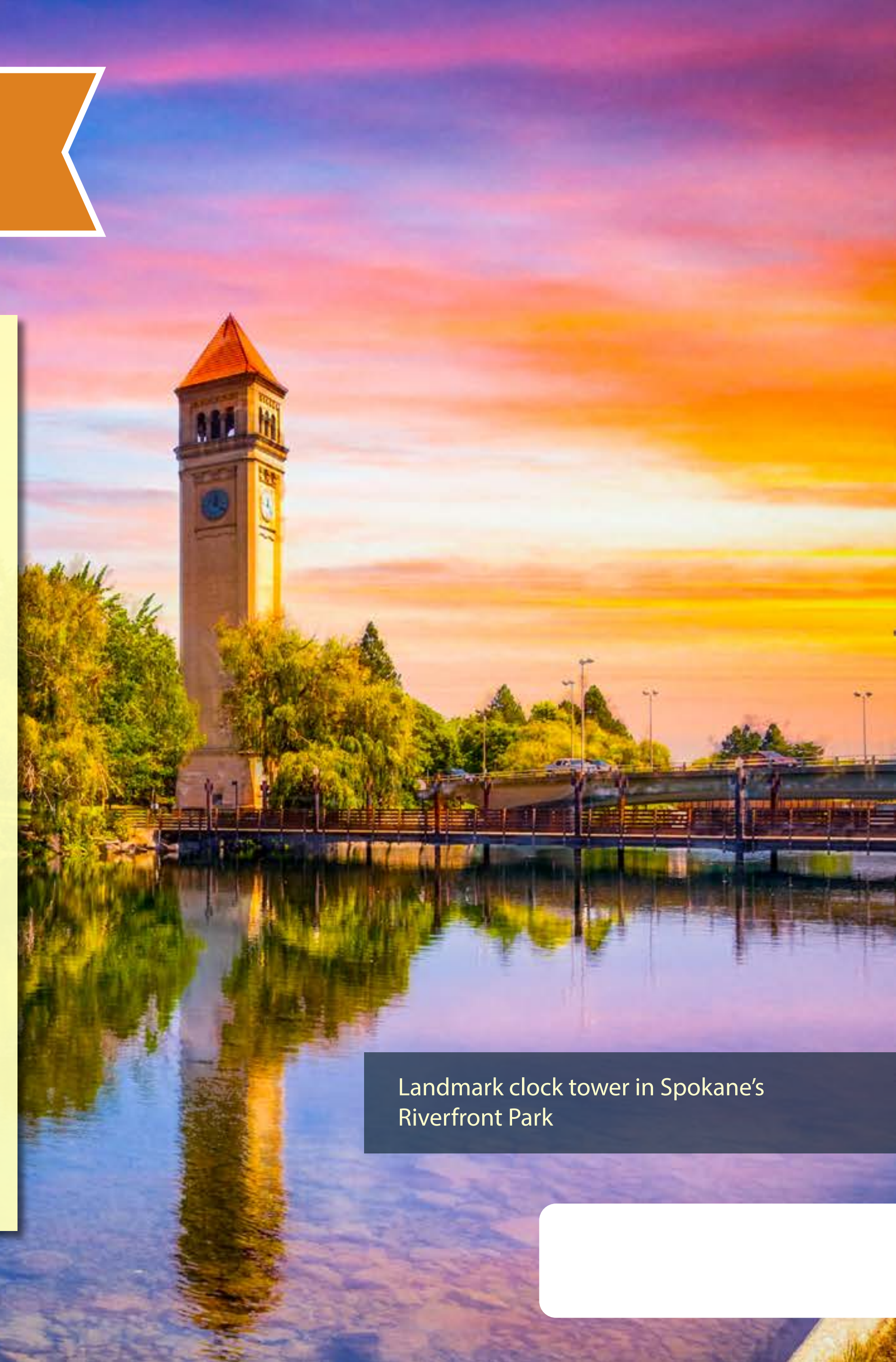
Landmark clock tower in Spokane's Riverfront Park

We answered 1,150 Helpdesk requests in FY2022. The most common questions were related to the funding governments received from COVID-19 federal programs.