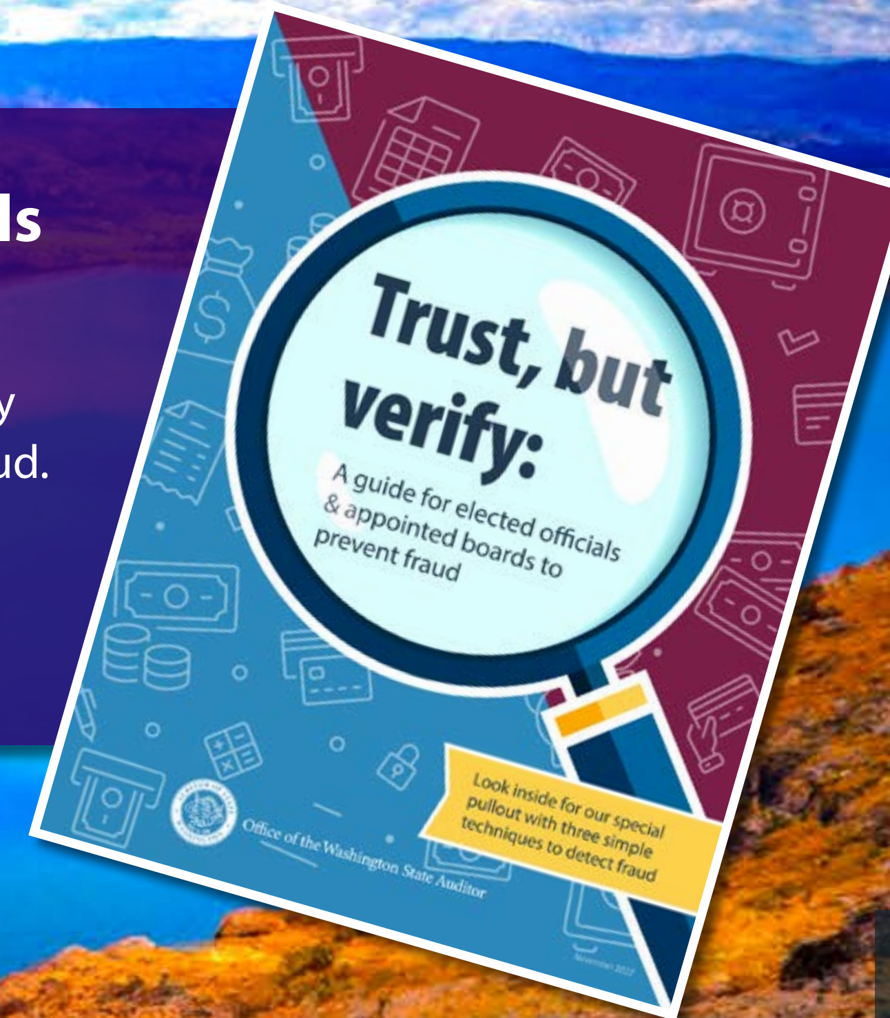
Wanapum Lake reservoir and recreation area

Elected officials and members of appointed boards have a key role to play when it comes to preventing, detecting and responding to employee fraud. In a first-of-its-kind guide for public entities, SAO's Special Investigations Team developed a resource for these leaders, including tips for policies and internal control best practices.