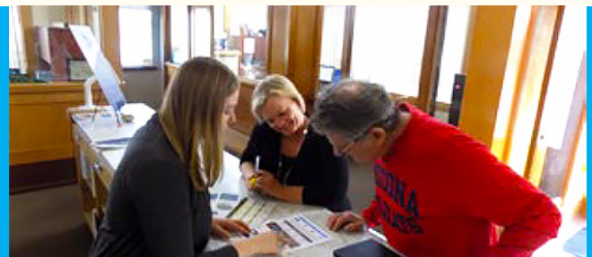
Utility customers receive a new resident packet

Following the Lean principle of Plan, Do, Check, Adjust and with the encouragement of city leadership, City of Ridgefield employees continue to evaluate their processes and identify other needed improvements.