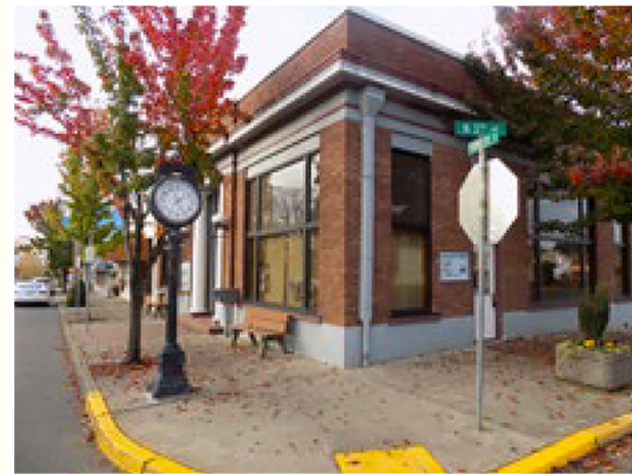
Ridgefield City Hall